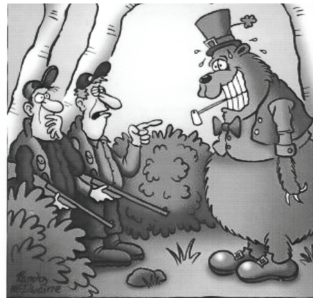
"Okay... if you're a leprechaun then let's see you Riverdance."