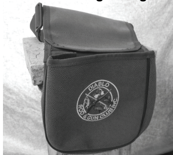
Shotgun bags $23.00