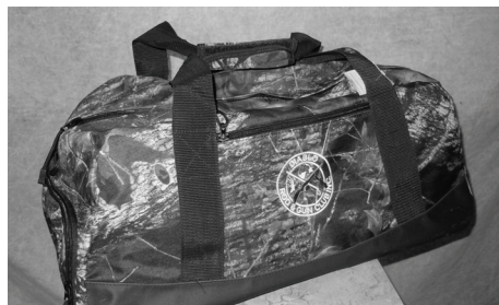
Utility Bags $45.00