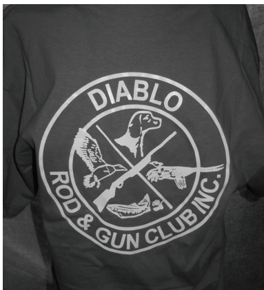
Sweat Shirts $25.00

NOW AVAILABLE AT THE CLUB HOUSE DURING MONTHLY MEETINGS