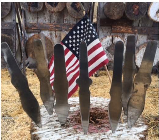
Tru-Balance Knives, Veterans Day on the range.