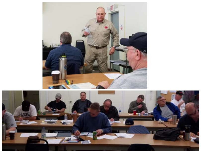
Diablo Members attending the NRA Metallic Reloading class at our Hunter Education building