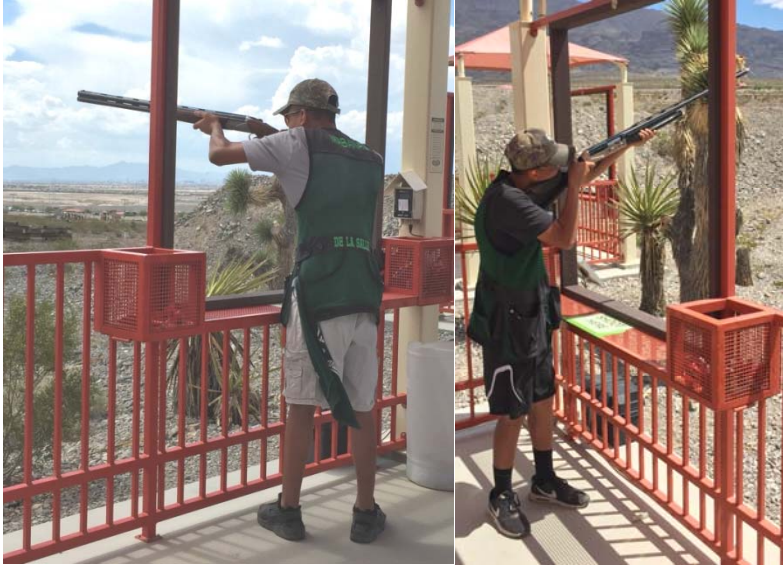
Shooting Sporting Clays at the West Course of the Clark County Shooting Complex.