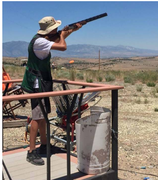
Carson Valley Sporting Clays

The July 21st shoot was at the Camanche Hills Hunting Preserve near Ione, CA. The most recent match on August 11th, was attended by twenty shooters from Diablo, was held at Rooster Ranch Wings & Sporting Clays in Hilmar, CA.