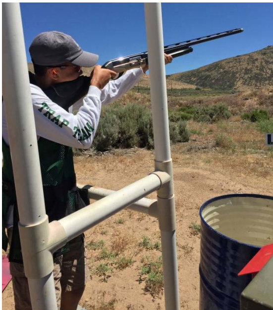
Capitol City Gun Club

Back in June, a small band of Diablo shooters traveled to the Carson City, NV area and shot at the Walker River Resort, Carson Valley Sporting Clays and at the Capitol City Gun Club, on three consecutive days.