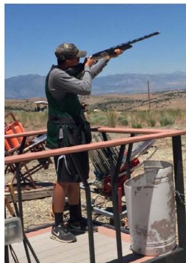
Carson Valley Sporting Clays

It seems only like yesterday on October 13, 2018, that the 2018 season ended for the Diablo Sporting Clays. It ended on a good note with a turnout of over 30 participants, and a hearty BBQ lunch to cap off an 8 shoot / match season. The 2019 season begins with the first match scheduled for April 20, 2019 at Quail Point in Zamora, CA. There are 10 different shoots (with two overnights) scheduled for 2019.