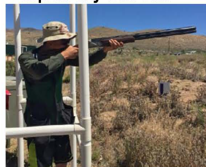
Look. Mount. Shoot!