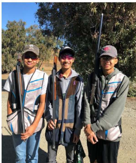
Musketeers at Birds Landing

The Diablo Sporting Clays crew travels to different courses like Camanche Hills, Rooster Ranch, and Raahagees, from late Spring into early Fall. At a couple of the shoots, such as our Nevada overnight trip, there is an opportunity to shoot at more than one course like Walker River Resort, Carson Valley Sporting Clays, and the Capitol City Gun Club.