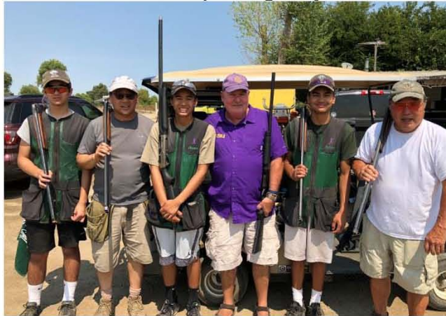
Rooster Ranch Wings & Clay, Newman, CA